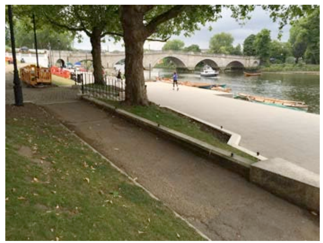
One of the many wonderful views in Richmond

Continue the walk under the bridge, to the road to Richmond, towards Richmond Park.