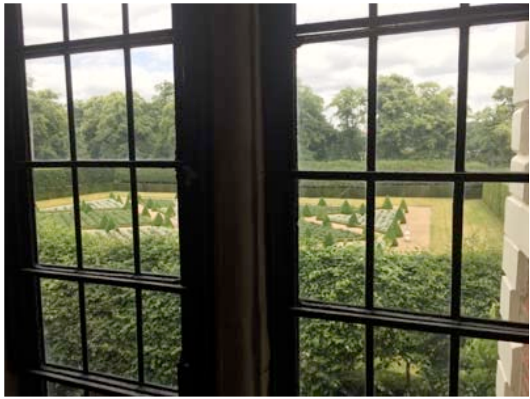
The Ham House, the garden