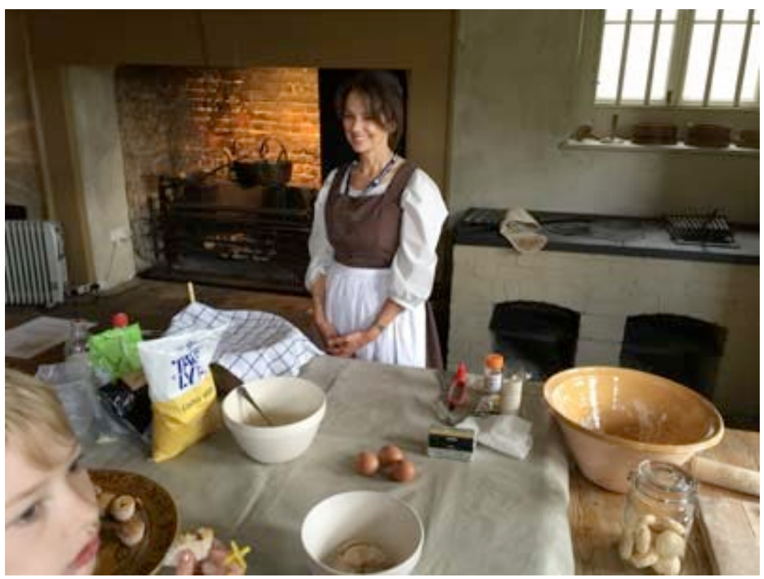
Inside Ham House