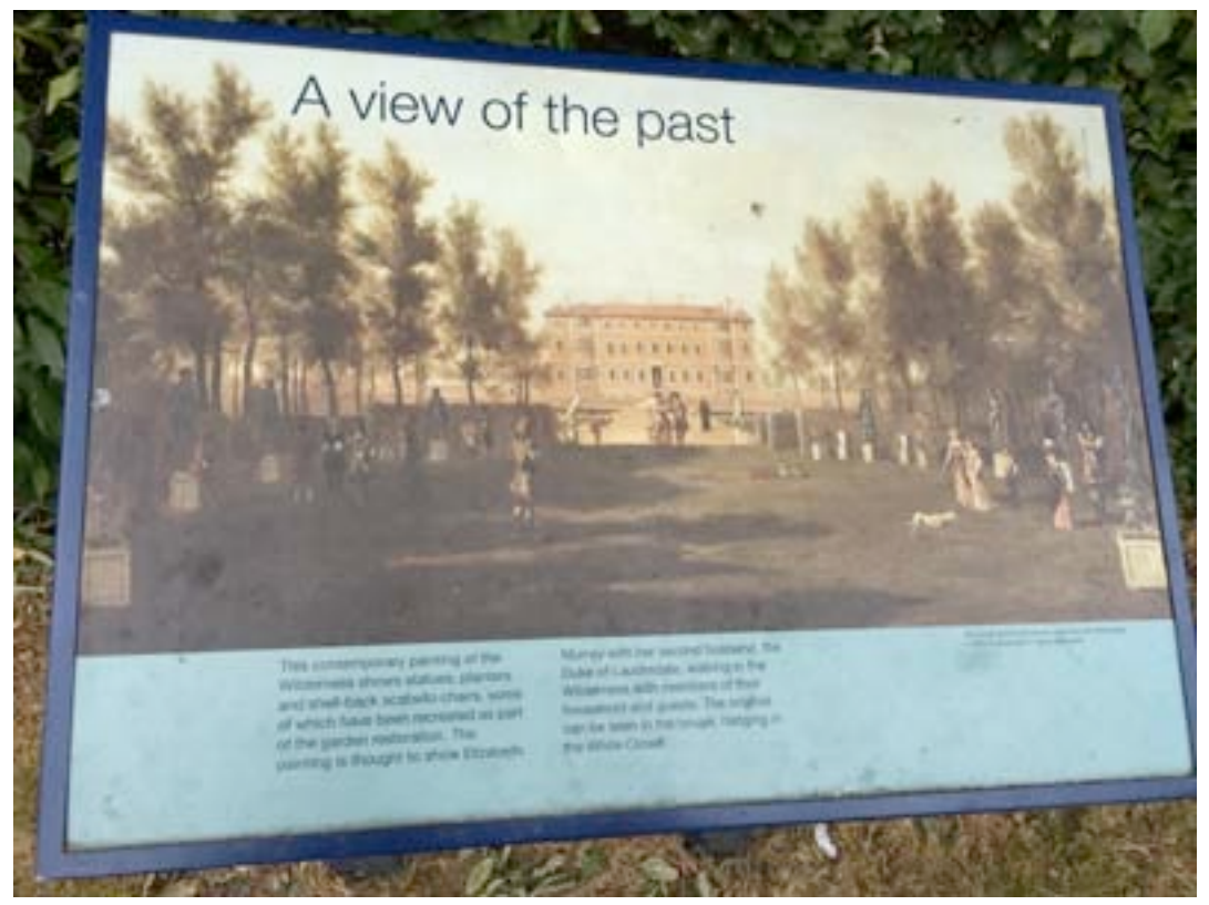
The Ham House in 1650