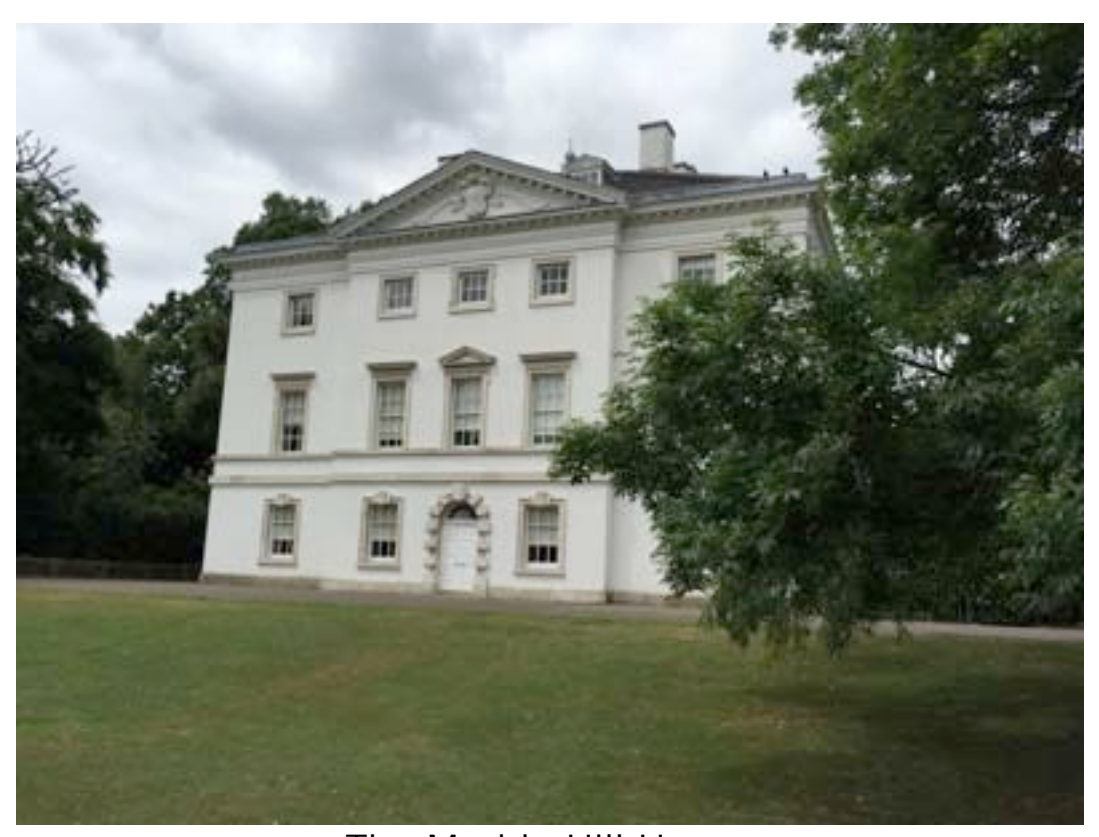
The Marble Hill House