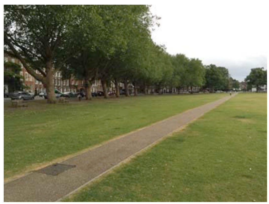
Richmond Green, you can see planes landing in nearby Heathrow. An extraordinary view.