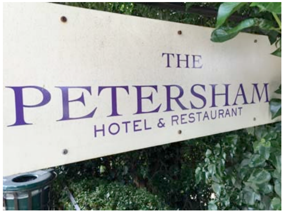
Sign to Petersham hotel & restaurant

Go down to Petersham to see this marvelous, historical hotel, restaurant.