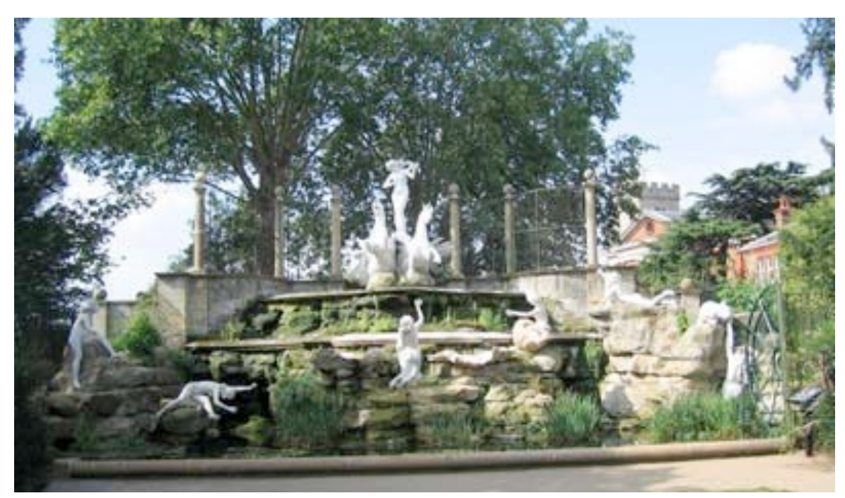
The Italian Fountain in Twickenham

Carry on to Twickenham along the riverside and then visit the Italian Fountain, the garden.