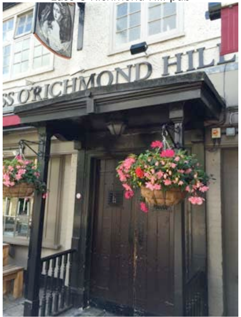
Lass O'Richmond Hill pub