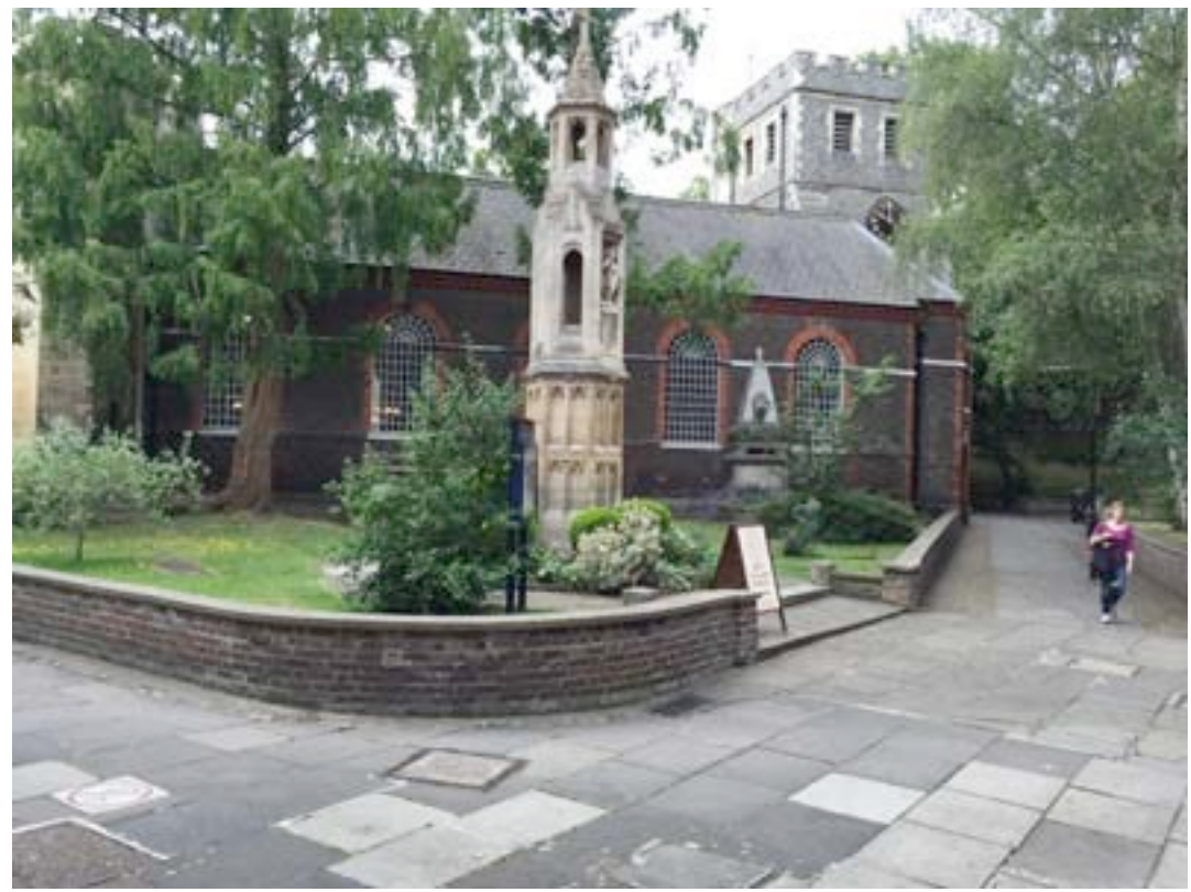
The church of Richmond

Richmond has a village countryside atmosphere.