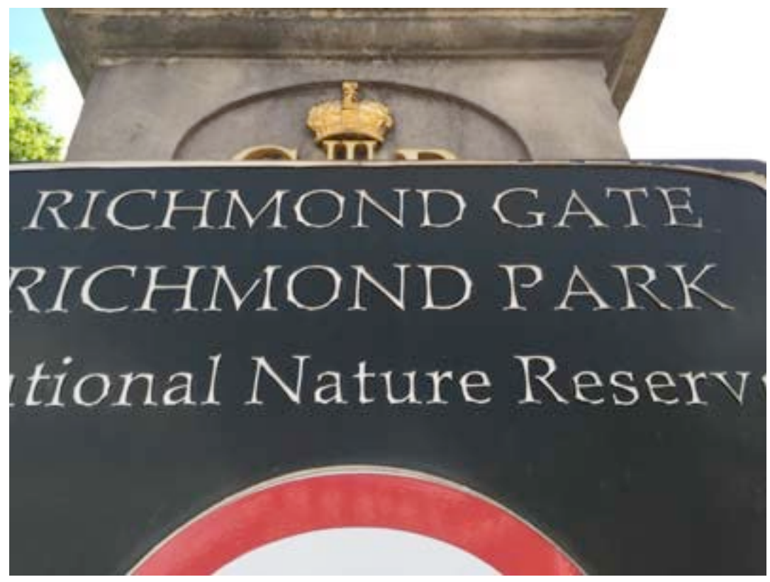
Entrance gate. It takes an entire day to visit the park.

Richmond Park was created in 1625 as a hunting deer park. Now the largest of London.