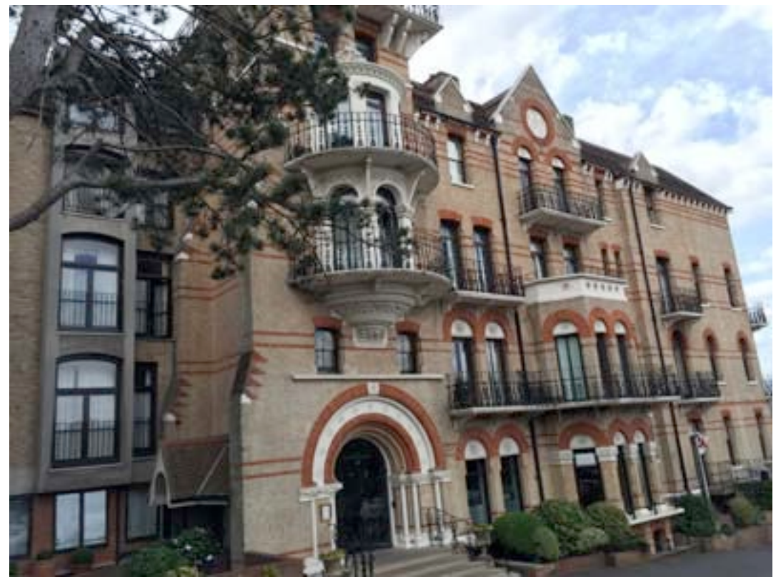
Petersham hotel & restaurant

From the restaurant Petersham, you will have a wonderful view over the Thames.