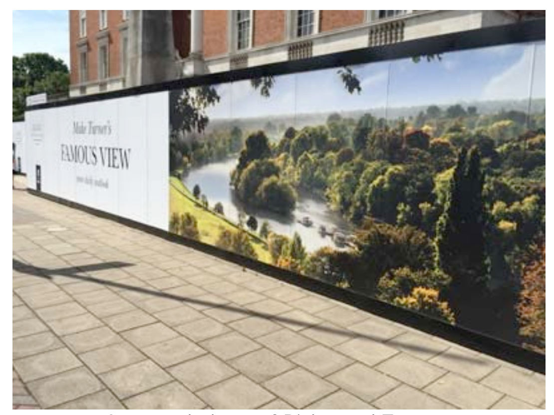
An actual photo of Richmond Terrace