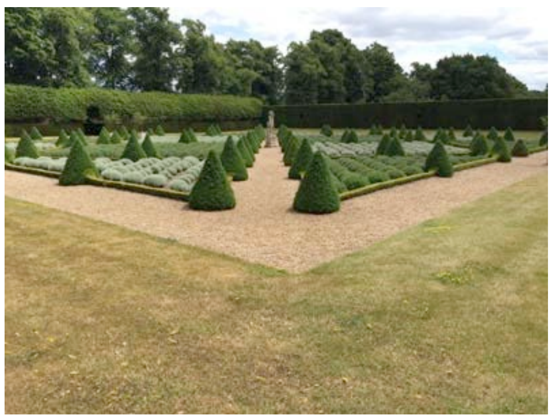
The Ham House, one of its many gardens

It is said, that it was at Ham house, that the lawn was invented in the 1650.