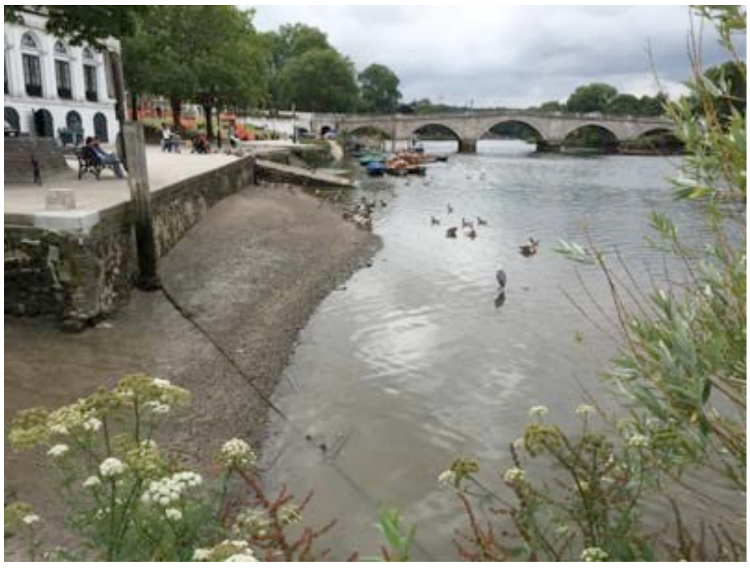
Tide of the Thames at Richmond

Continue along the left side of the river. Enjoy the scenery: Richmond Bridge, many workshops, countless pubs.