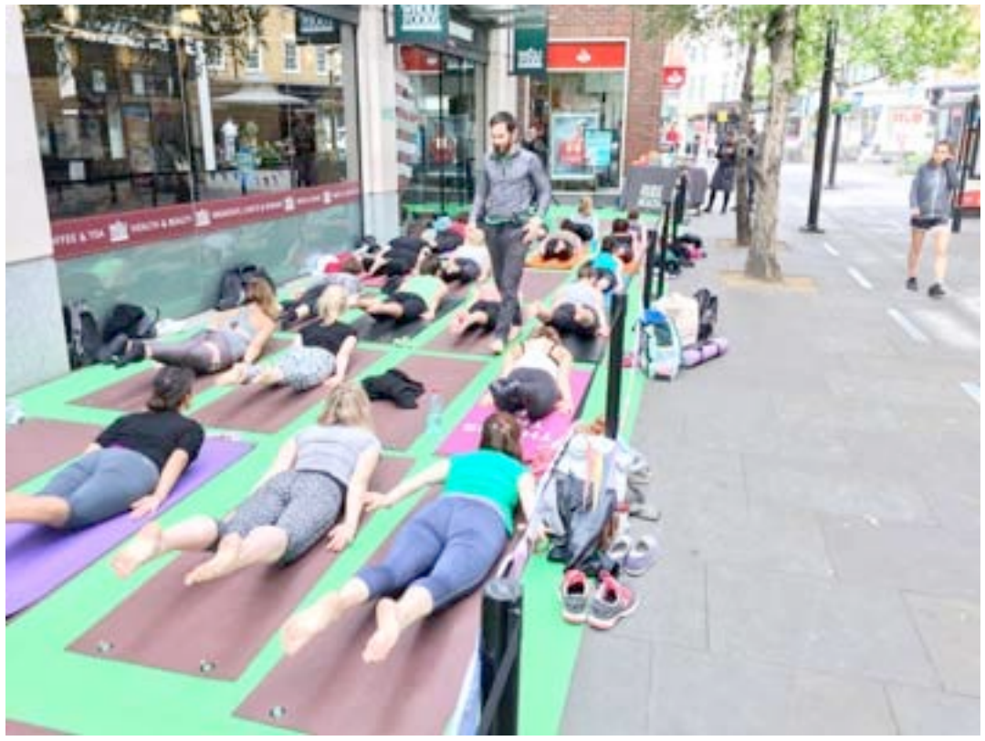
The international Yoga day 2015 in Richmond

Walk towards Richmond town, visit the surroundings near the church.