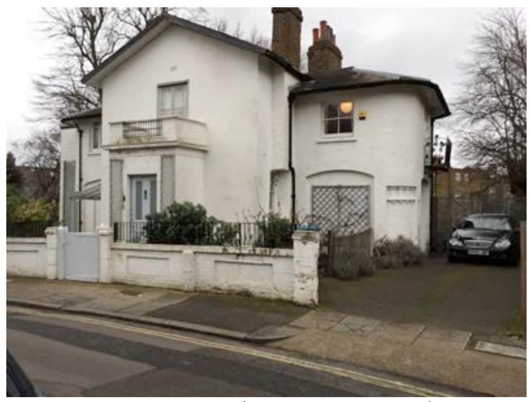
Turner's house (designed by himself)

It is a private house now. There are plans to create a museum.