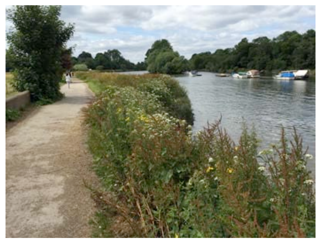
Path from Richmond to Ham house