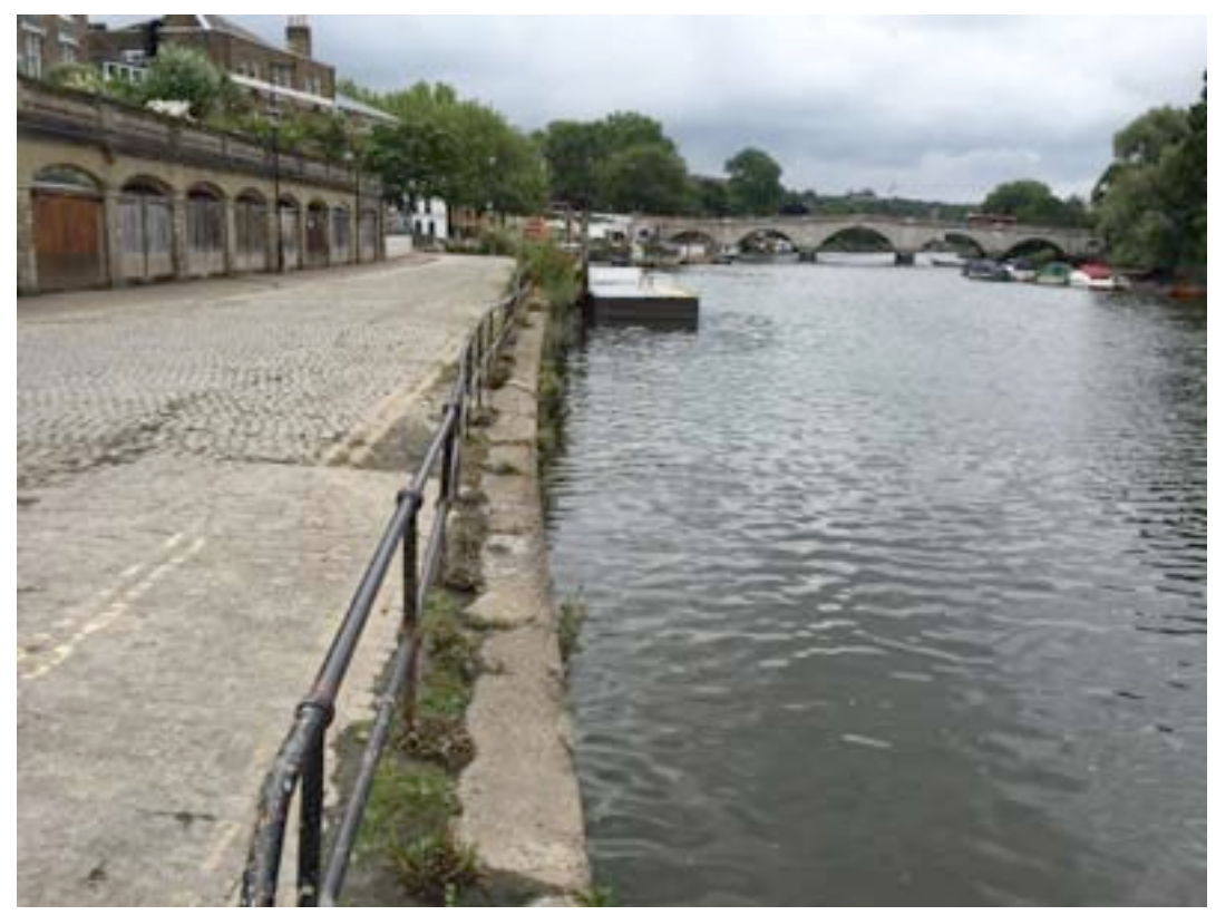
The Thames at Richmond

From Richmond Green go down to the Thames, take Friars Lane until you see the river.